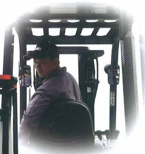
EXCELLENT REAR VIEW