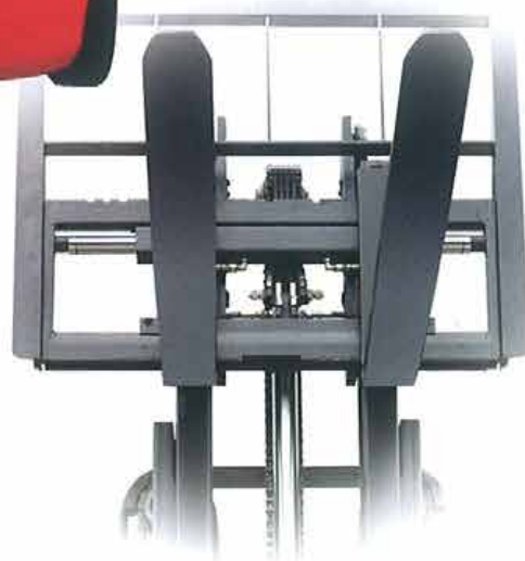
EXCELLENT TOP VIEW