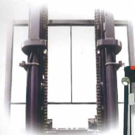
EXCELLENT FRONT VIEW