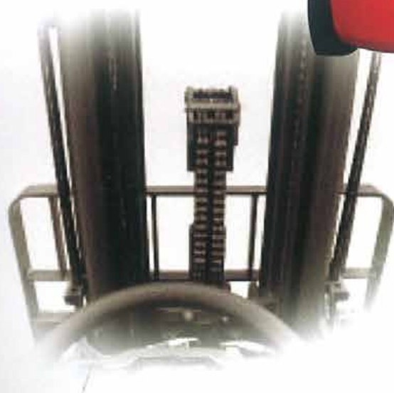
EXCELLENT DOWN VIEW